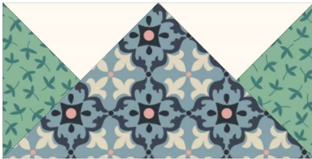
Flying Geese block.

Lay out the fabric pieces for your block. Make up the Flying Geese blocks by sew the two small triangles together. Next stitch the long side of the small triangle to the short side of the larger triangle.